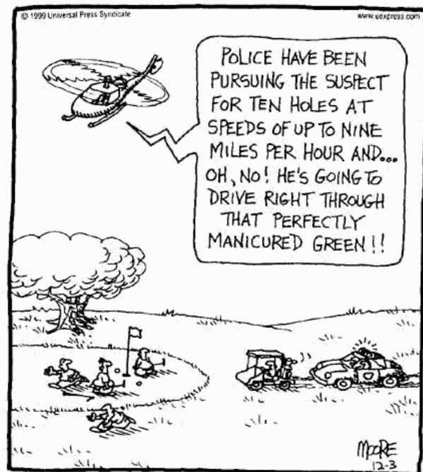
World's Scariest Golf Cart Chases.

Reprinted from The Funny Times / PO Box 18530 / Cleveland Heights, OH 44118 phone: (216) 371-8600 / e-mail: ft@funnytimes.com